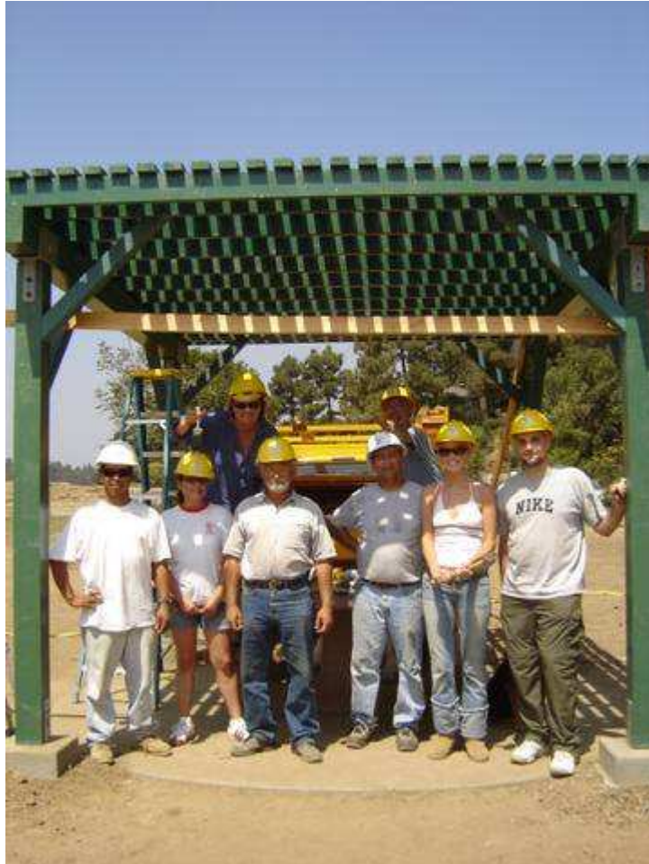
Los Angeles, CA