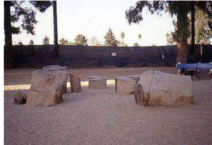
Long Beach, CA